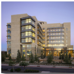
Robert E. Coyle Federal Courthouse