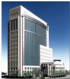
Robert T. Matsui Federal Courthouse

Schools will receive an invitation to participate. Because there is limited seating available, the schools chosen to participate are in the order in which their registration form is received. Each of the three courts have individual registration processes. Please check with your local court for specific information.