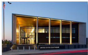
Bakersfield Federal Courthouse